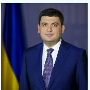
Volodymyr Groysman Prime Minister of Ukraine

The Cabinet of Ministers of Ukraine (Government) is the main body responsible for policy formulation in the sphere of digital government and information society creation.