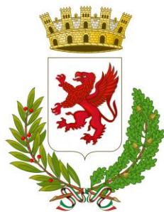
Comune di Narni