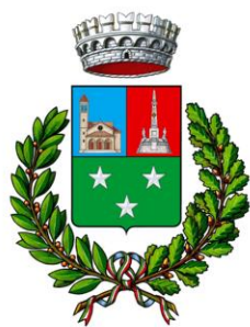
Comune di San Fermo della Battaglia