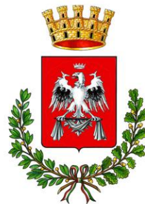
Comune di Todi