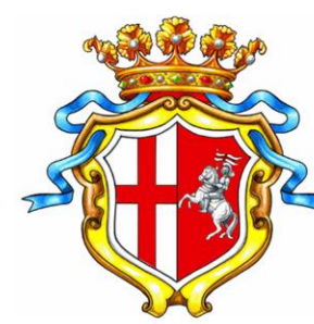
Comune di Spoleto