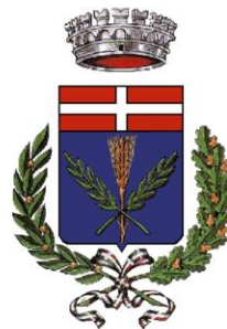
Comune di Calcinato