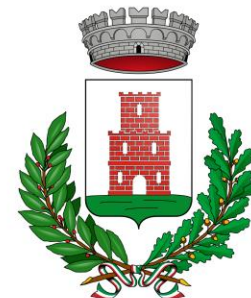
Comune di Monte Castello di Vibio