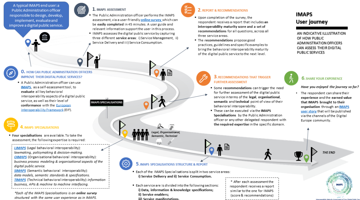
Figure 2: IMAPS to TIMAPS user journey

The figure below illustrates a typical user journey for the IMAPS end user and shows how IMAPS recommendations can trigger the need for an assessment with TIMAPS survey.